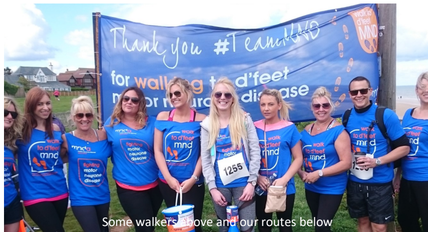
Some walkers above and our routes below